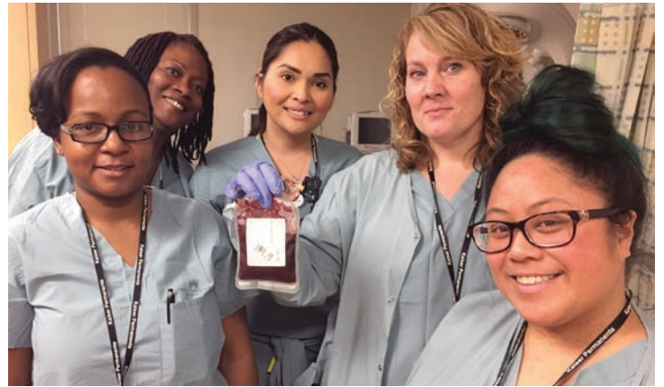
Kaiser Permanente San Francisco partners with CCBC to launch a public cord blood collection opportunity for expectant parents.