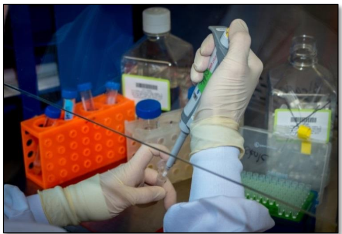
Photo 4: Cleveland Cord Blood Center researchers explore the use of cord blood-derived cells as regenerative cell therapies for diseases ranging from Parkinson's disease and HIV/AIDS to diabetes and wound healing.