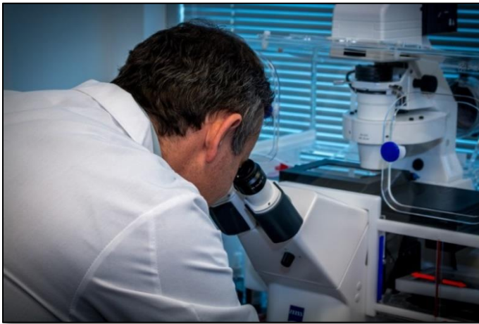
Photo 3: Microscopy is used by CCBC scientists to examine cord blood cells.