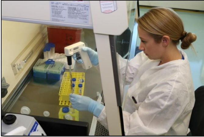
Photo 1: Cord blood units donated to the Cleveland Cord Blood Center are tested and processed.

To request a photo(s), please contact Yopko Penhallurick Public Relations at jp@yp-pr.com or bw@yp-pr.com or 440-543-8615.