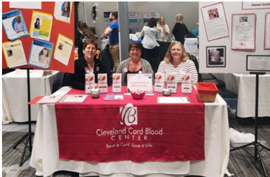
Babies & Bumps Cleveland