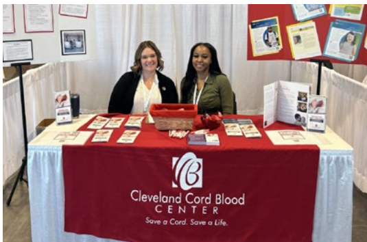
Atlanta Prego Expo 2023