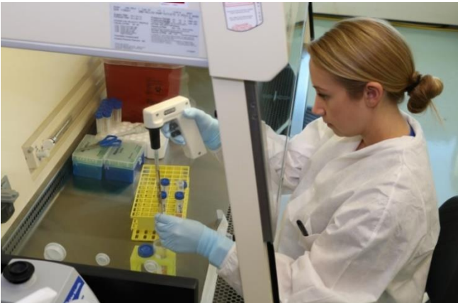
Photo 1: The Cleveland Cord Blood Center collects, processes, stores and distributes stem-cell rich umbilical cord blood for transplantation and research. Units are collected from six collection sites.

To request a photo please contact Cleveland Cord Blood Center at ctaddeo@clevelandcordblood.org or mfinney@clevelandcordblood.org or 216-896-0360