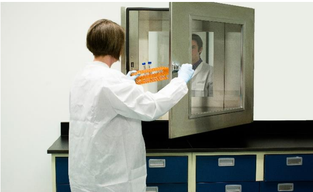
Photo 5: Formed in 2018 and launched independently in 2020, the Cleveland Cell Therapy Institute (CCTI) is one of CCBC's two social enterprise subsidiaries.