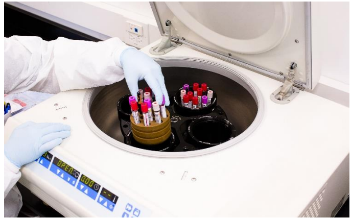
Photo 2: Technicians prepare a CCBC cord blood unit for cryopreservation. Since 2008, CCBC has distributed cord blood units in 32 states and 21 countries.